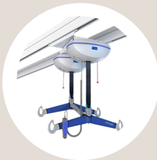
Maxi Sky® 2 Plus and slings for seated and lateral transfers SWL* 454 kg (1000 lbs)