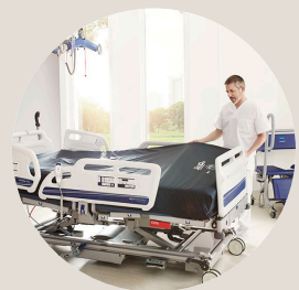
Skin IQ® 1000 SWL* 454 kg (1000 lbs)