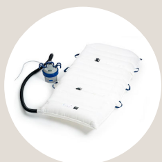
Maxi Air® air assisted transfer system SWL* 544 kg (1200 lbs) MaxiSlide® sliding sheets