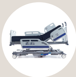
Citadel® Plus SWL* 454 kg (1000 lbs)