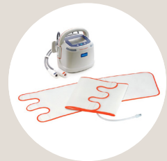
Flowtron® ACS900 pump with Tri Pulse™ or DVT™ 60L garments – up to 81 cm (32") in calf size