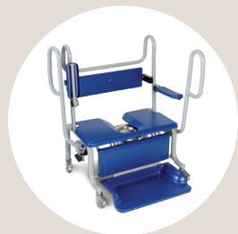
Carmina® SWL* 320 kg (705 lbs)