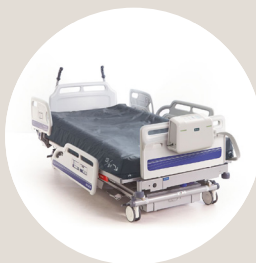
Auralis® Plus 454kg (1000 lbs)