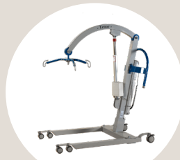
Tenor® and slings for seated transfers SWL* 320 kg (704 lbs)